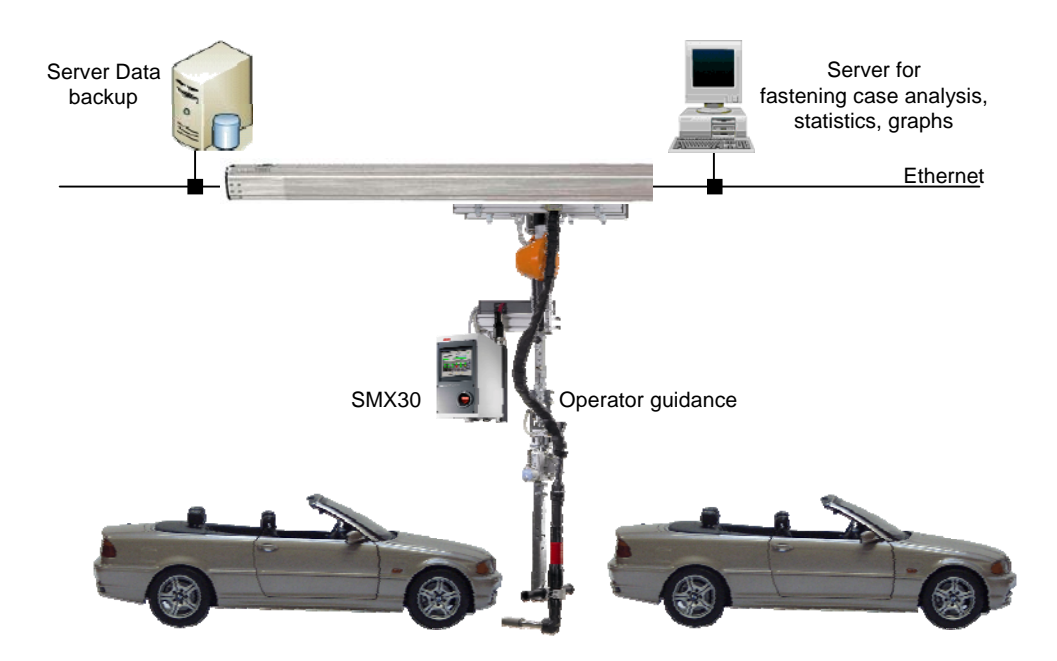
Master- Slave configuration SMX30 / SMX10